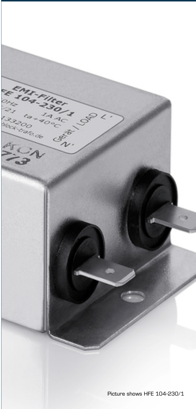
Picture shows HFE 104-230/1